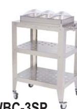
WBC-3SP 3 Pans & 3 Individual Lids

WBC-2RT, WBC-2SP, WBC-3RT WBC-3SP: 200 Watts / 1.7 amps / 120 Volts / 60 Hz 1 Temperature Control (active heat area: 22-1/8" x 15")